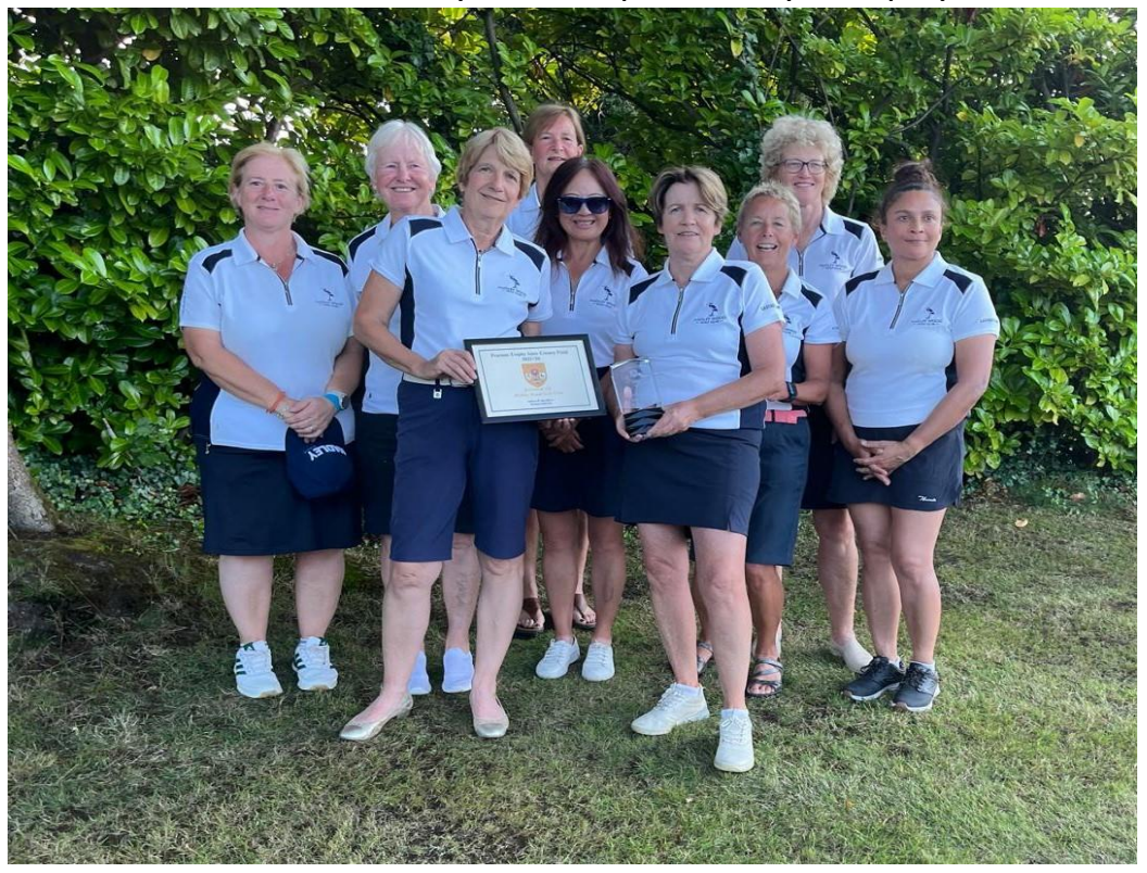
Congratulations to Surrey's Roehampton – winners of the 2023-24 Pearson Trophy.